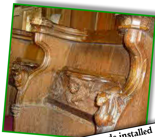
Fine carved misericords installed by 1541