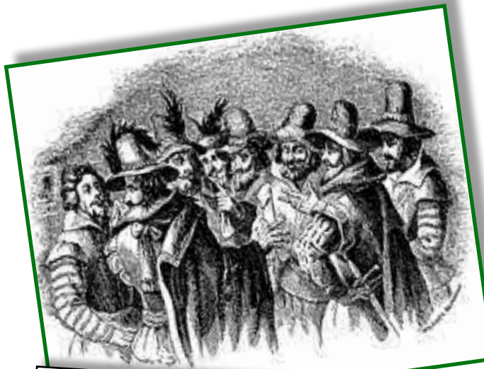
Guy Fawkes' Gunpowder plot 1605