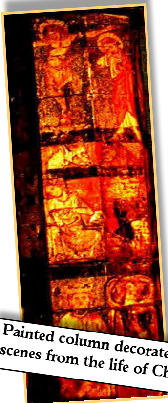
Painted column decorated with ten scenes from the life of Christ 1306