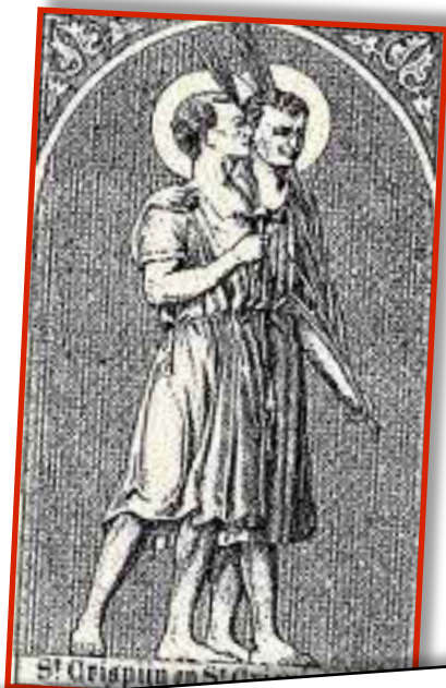
Roman soldiers St Crispin and Crispianus, later Christian martyrs, become shoemakers in Faversham 286

Now see if you can do the same for some of the important events that have happened at St Mary of Charity church in Faversham.