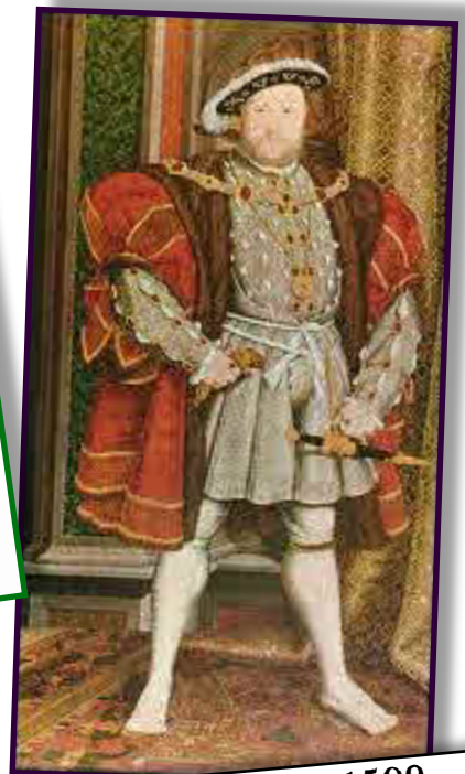
Henry VIII becomes king 1509