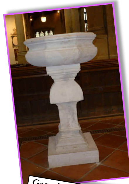
Georgian font restored 2006