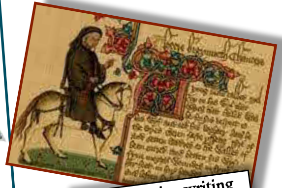
Chaucer begins writing The Canterbury Tales 1387