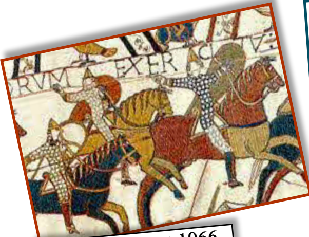
Norman Conquest 1066

Look at these pictures showing some events from the past. Can you draw lines to put them in the right order on the time line?