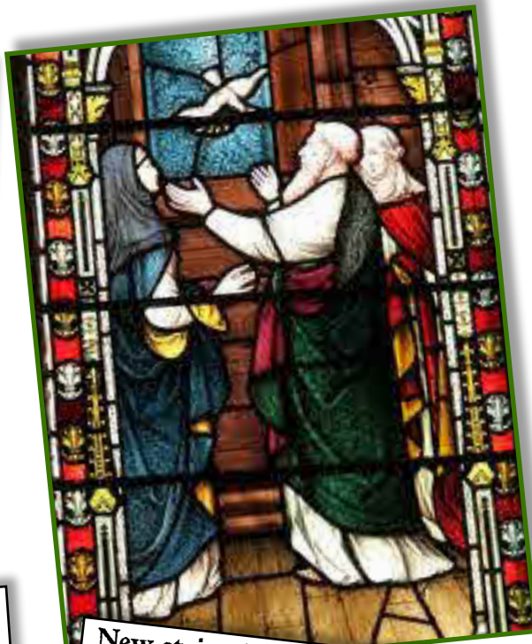
New stained glass windows began to be installed 1871