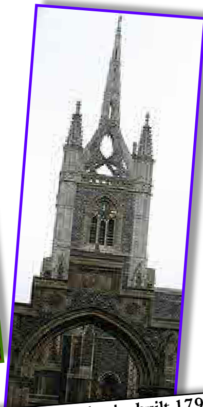
New tower and spire built 1797